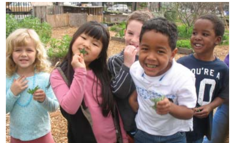
Above: Students watering amongst the towering sunflowers at the start of the school year. Below: Enjoying garden fresh greens!