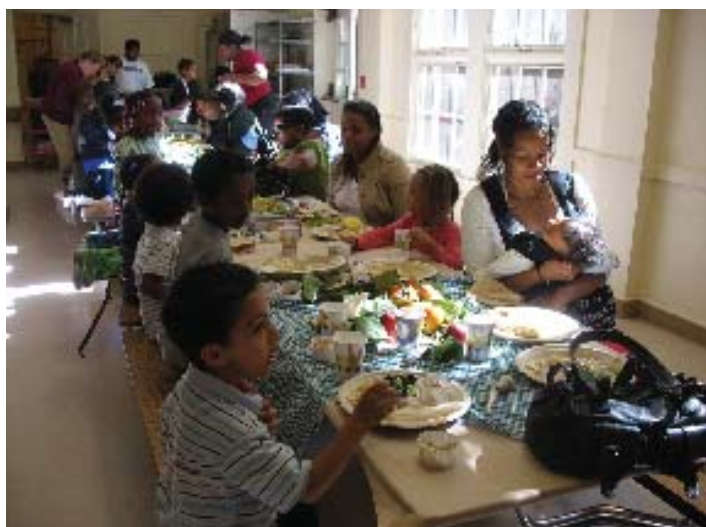
October's Family Lunch Day brought together families and guardians for a seasonal meal and tastings prepared by Nutrition Services and the Garden and Cooking Program.