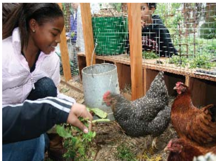
Students feed chickens in their new home at John Muir.